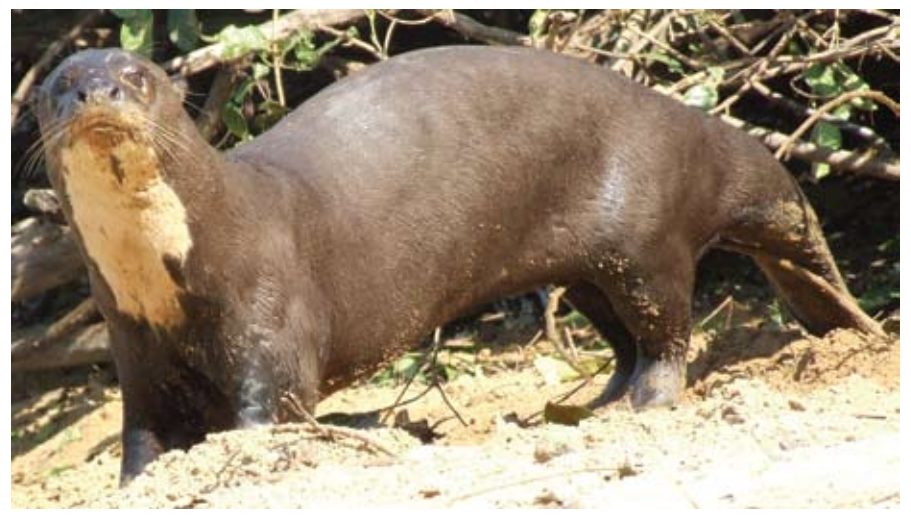
Fig. 1. Representative of the Giant Otter showing distinctive chest markings by which individuals may be recognized.

also was outstanding in the defense of the group, which was lactating during the reproductive season, and which manifested more attachment to the cubs. We compared the individuals' identities with pictures registered between August/2002 and October/2003 by Ribas (2004) in the same study area. This was used to confirm the presence of the groups in the area since 2002-2003, and also to roughly estimate the age of the individuals that remained there until this study.